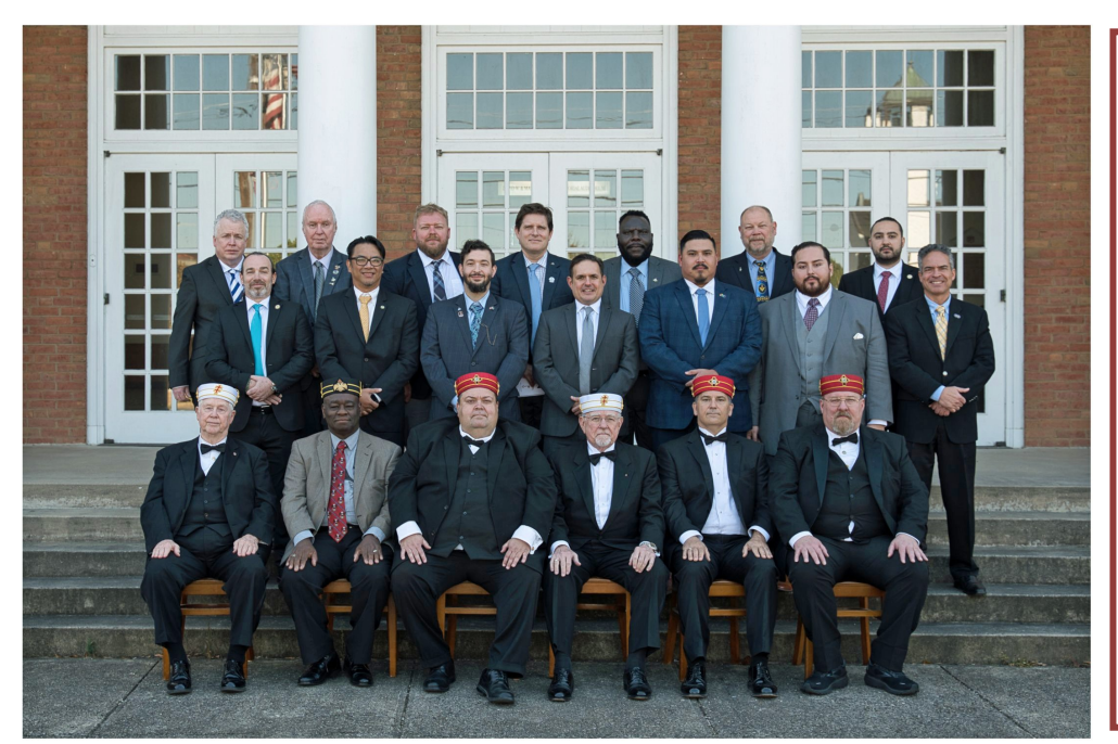
Alexandria Scottish Rite 2022 Fall Reunion

Congratulations to all our new Masters of the Royal Secret. See our traditional class picture below.