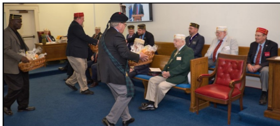
Alexandria Scottish Rite Brothers passing out the Feast of Tishri Fruit offerings.