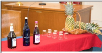
Feast of Tishri Toasters Table