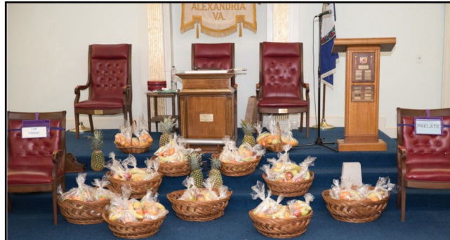
Alexandria Scottish Rite Lodge Room set up with Feast of Tishri offerings — Baskets full of fruit