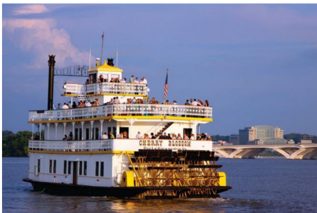
Cherry Blossom Stern-wheeled Riverboat September 28, 2023