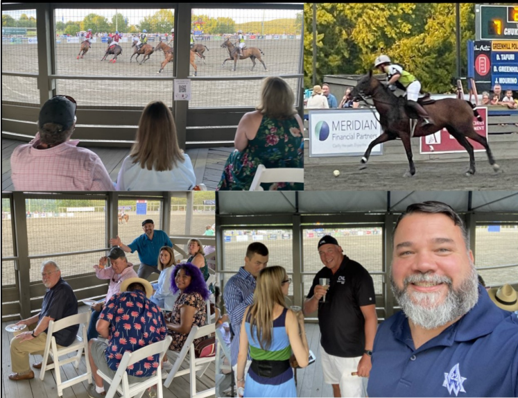
"Polo, Cars & Cigars" Night , The Plains, VA. Alexandria Scottish Rite Brothers and their significant others watched twilight polo.