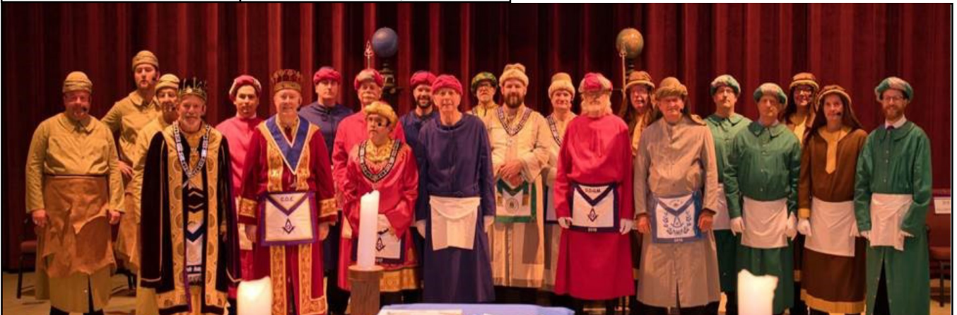
Alexandria Scottish Rite Blue Lodge Night Cast— Second Section Master Mason Degree