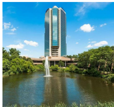
Hilton Mark Center Alexandria, Virginia September 28–30, 2023