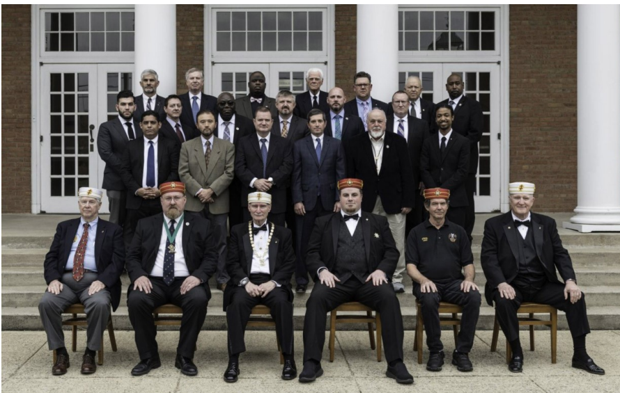
Alexandria Scottish Rite 2019 Fall Reunion

Brethren, I am excited about our May Gala and know you will have a great time!