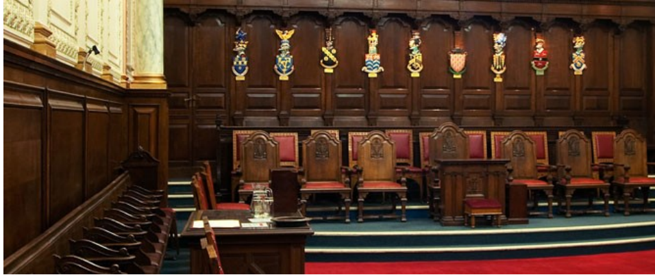
(Supreme Council A & AR of England and Wales and Provinces Overseas)

The English working of the Rite is commonly known as the Rose Croix from the title of the initiate to the 18°. On joining the Rite, each candidate has conferred on him the 18°. The Intermediate Degrees (4° to 17°) are conferred by name only during initiation, but there are many opportunities to witness demonstrations of those degrees. The Supreme Council issues all new Princes Rose Croix with a beautiful parchment document recording their membership in the Rite.